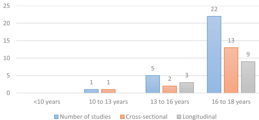
Fig. 2 Number ( n = 26 ) of included studies for each mean age divided in categories. Two studies investigated two age categories which were presented separately [7, 18].